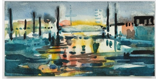
Sea Lanes II