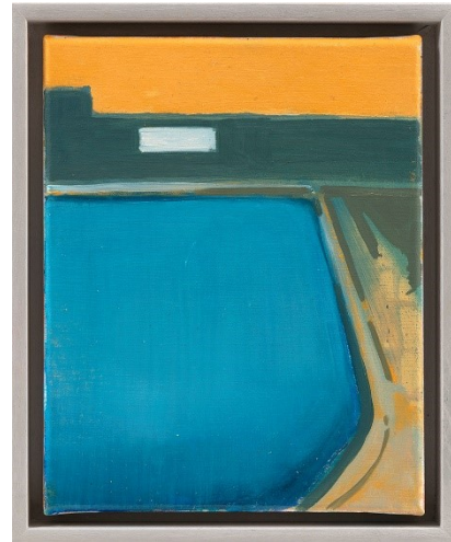
Pool Ready Oil on canvas, 37 x 42 cm. Framed. £ 250