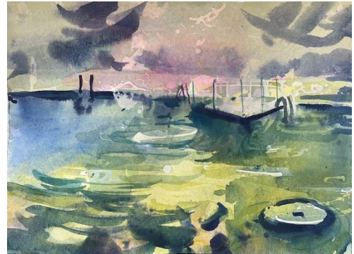
Just Looking, Hampstead Ponds