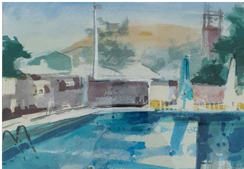
Back of the pool, Pells