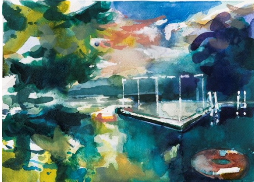
Quiet Moment, Hampstead Ponds