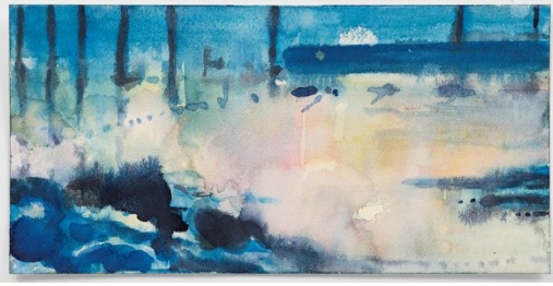
Sea Lanes I