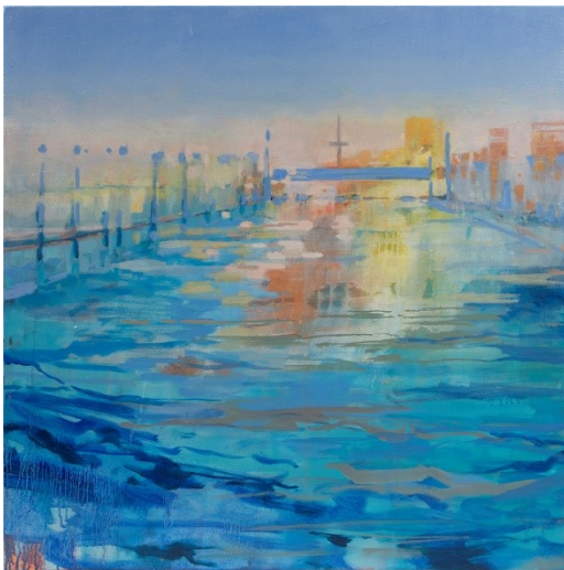
Sea Lanes Oil on canvas, 80 x 80 cm. Deep edge canvas. £ 650