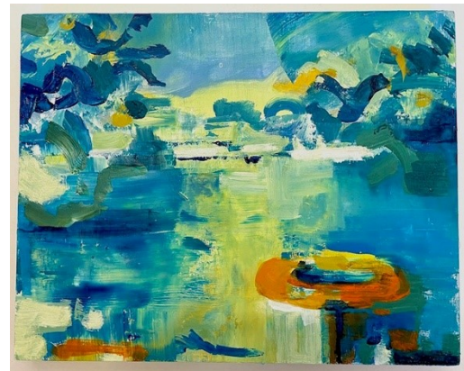
Immersed in water Oil on wood, 36 x 29cm. Framed. £ 250