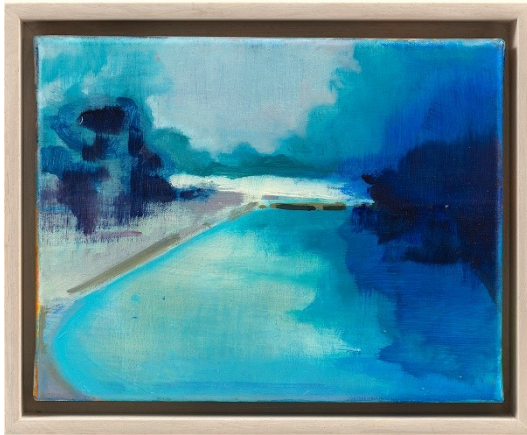
Immersed in Blue Oil on canvas, 42 x 37 cm. Framed. £ 250