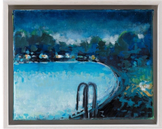
Night Swim Oil on canvas, 42 x 37 cm. Framed. £ 250