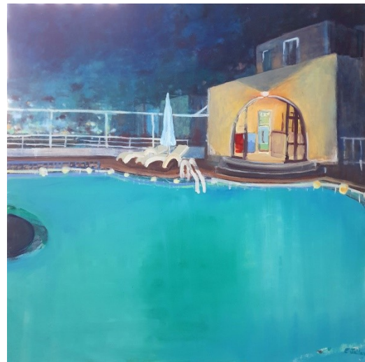
Evening Pool Oil on canvas, 80 x 80 cm. Deep edge canvas. £ 650