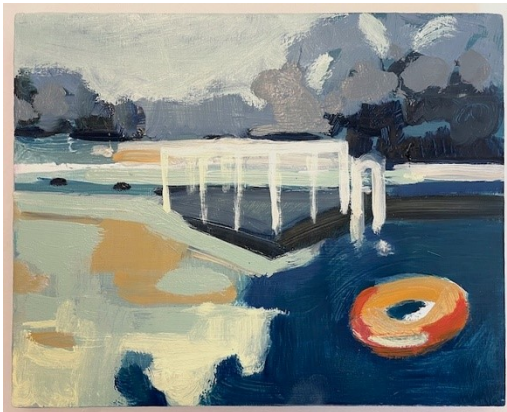
Swim Hole Oil on wood, 36 x 29cm. Framed. £ 250