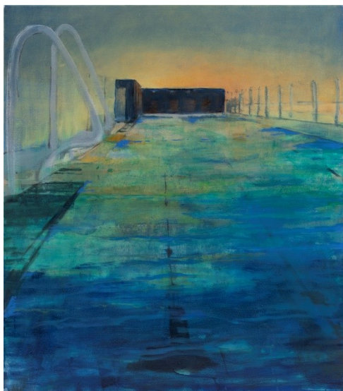
Looking West, Sea Lanes Oil on canvas, 70 x 80 cm. Deep edge canvas. £ 650