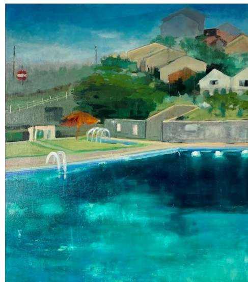
Deep End, Saltdean Lido Oil on canvas, 70 x 80 cm. Deep edge canvas. £ 650