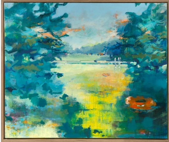
Summer Bathing, Hampstead Ponds Oil on canvas, 128 x 108 cm. Framed. £ 1000