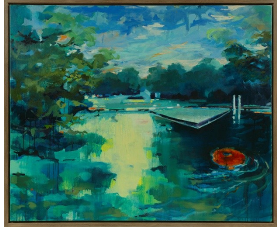
Summer Dip, Hampstead Ponds Oil on canvas, 128 x 108 cm. Framed. £ 1000