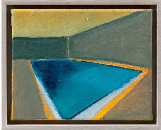
Sculpted Pool Oil on canvas, 42 x 37 cm. Framed. £ 250