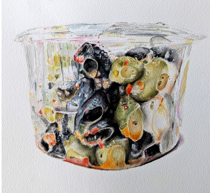
Olives in a plastic tub

Watercolour, 25.5 x 22.0 cm. Framed £ 250. Print on archival 220gsm watercolour paper. Unframed £ 40