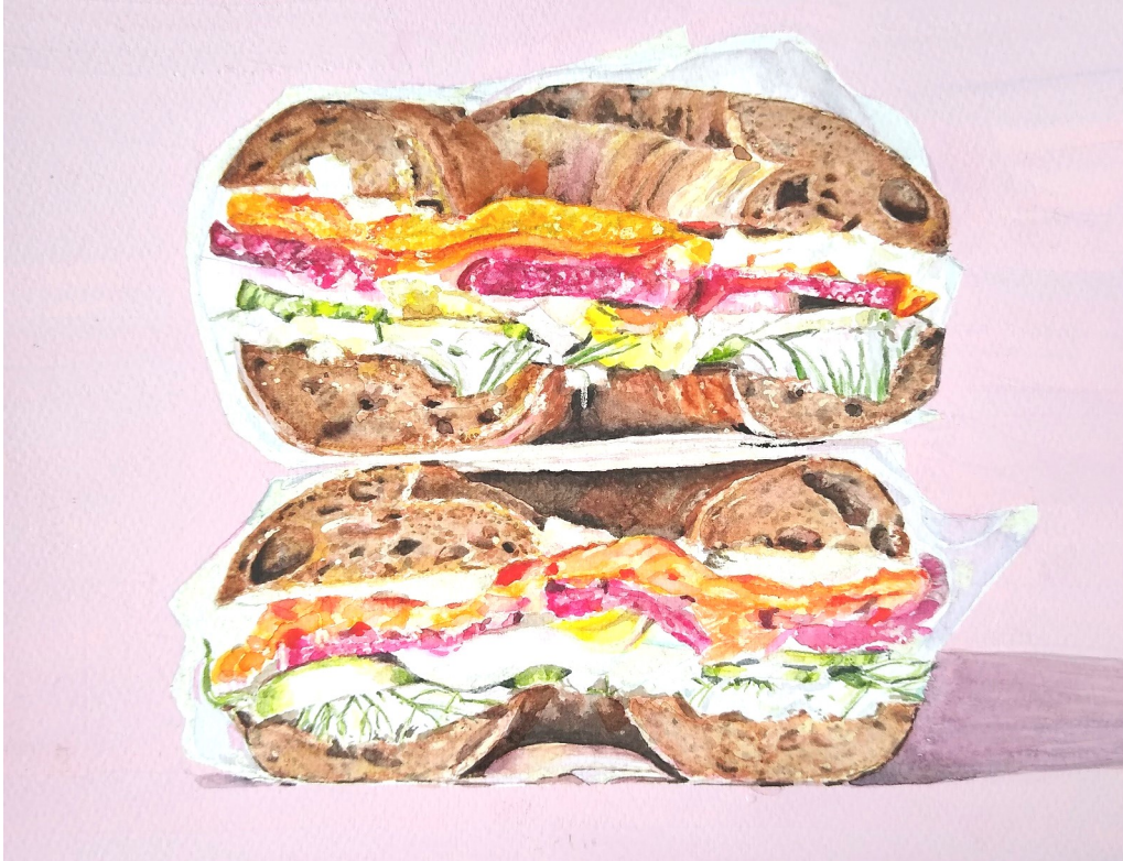
Good Morning Bagel

Watercolour, 26.2 x 23.4 cm. Framed £ 250 Print on archival 220gsm watercolour paper. Unframed £ 40