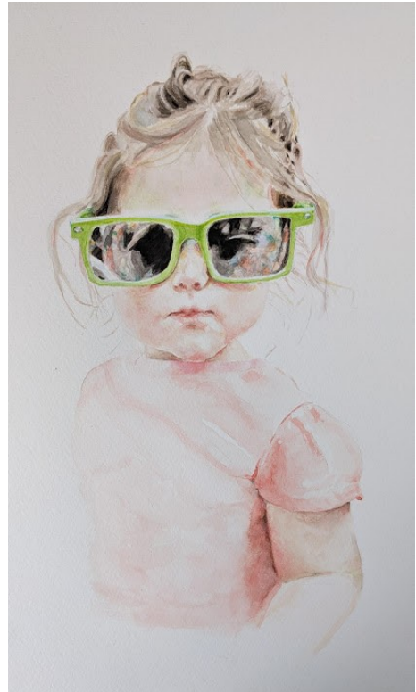
Poppy Watercolour, 34.5 x 45.0 cm. Not for sale