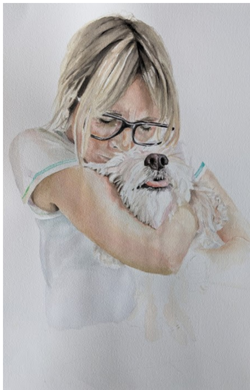
The Goodest Boy Watercolour, 38.0 x 45.0 cm. Not for sale