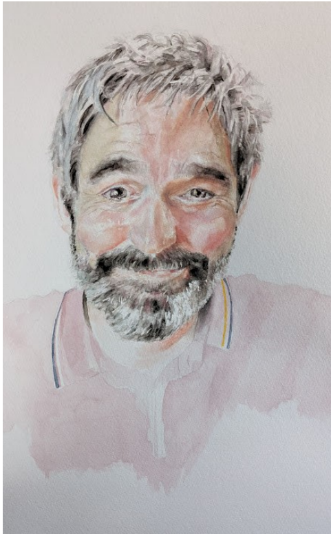
Tony Watercolour, 34.5 x 45.0 cm. Not for sale