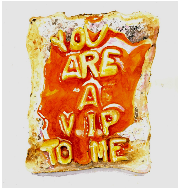
Everyone's a VIP to someone

Watercolour, 28.5 x 28.5 cm. Framed £ 250. Print on archival 220gsm watercolour paper. Unframed £ 40