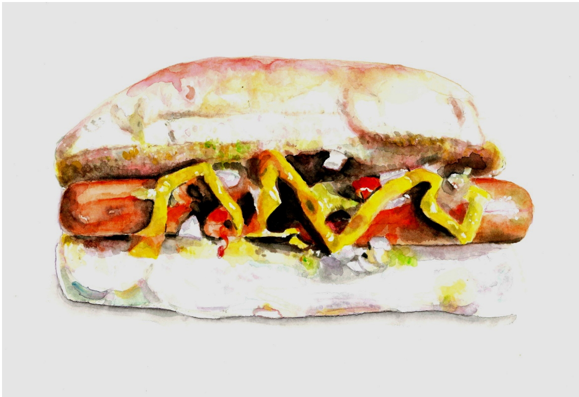
Filthy Watercolour, 34.4 x 23.2 cm. Not for sale