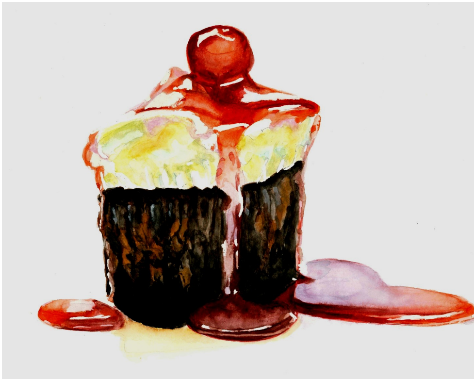
Cherry on top

Watercolour, 22.5 x 24.5 cm. Framed £ 195