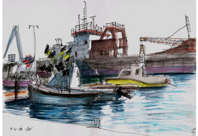
Boats, Shoreham Port

Pen and coloured ink 29x20cm. Framed £ 350