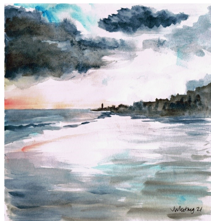
Low tide evening Coloured ink wash 19x18cm. Framed £ 250