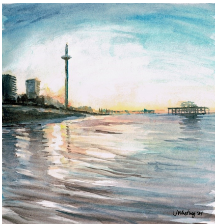
Low tide morning Coloured ink wash 19x18cm. Framed £ 250