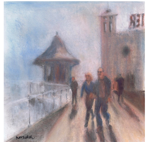
Rockers on the pier Pastel 29x29cm. Framed £ 350