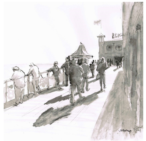
Pier shadows Pen and Chinese ink 28x28cm. Framed £ 350