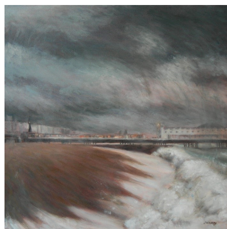
Stormy beach Oil on canvas 60x60cm. Framed £ 950