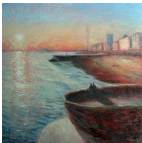
Sunset on Brighton Beach Oil on canvas 60x60cm. Framed £ 950