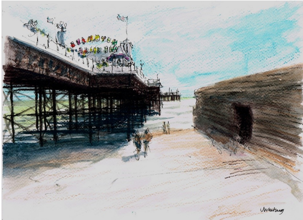
Pier side in May

Pen and coloured ink 29x20cm. Framed £ 350