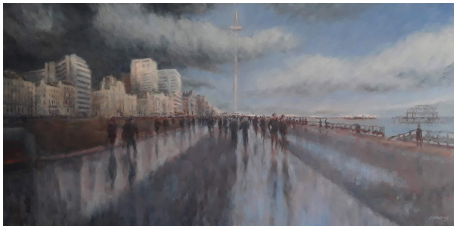
After the rain, Hove Promenade Oil on canvas 100x50cm. Framed £ 1500