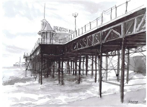
Palace Pier Pen and Chinese ink 39x29cm. Framed £ 380