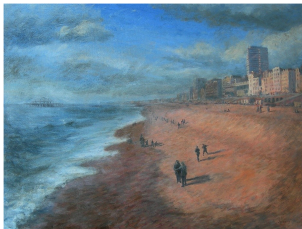
Blustery day on Brighton Beach