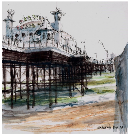
Beside the pier in June Pen and coloured ink 19x18cm. Framed £ 250