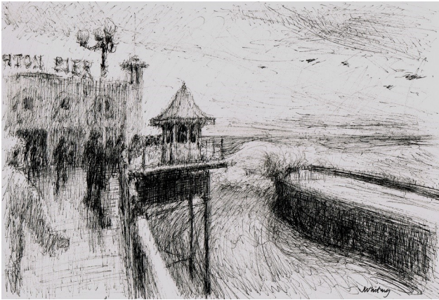
Big swell on the pier Pen and ink 29x20cm. Framed £ 350