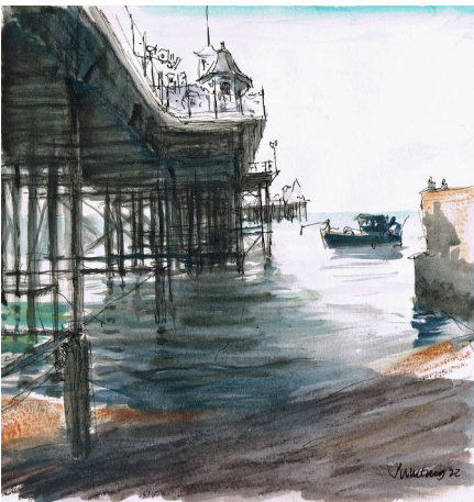
Still water under the pier Pen and coloured ink 19x18cm. Framed £ 250