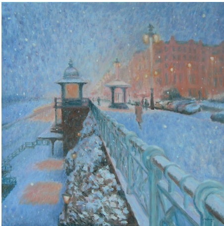
Snow on Kings Cliff