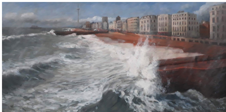
Rising tide, Brighton Beach Oil on canvas 100x50cm. Framed £ 1500