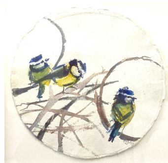
Blue Tits II