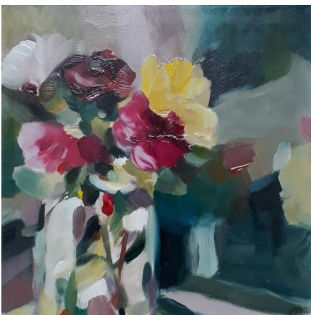
Brighton my day