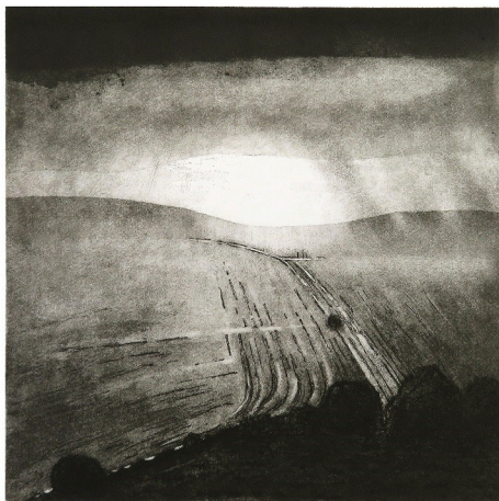
A guiding light

We are thrilled to be showing Tania's work for the first time at 35 North and to present a series of her etchings.