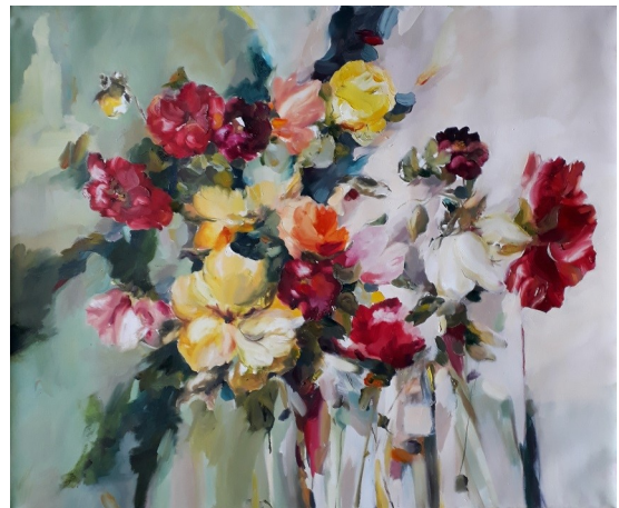
It never rained