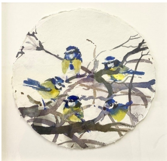
Blue Tits I

Her work has several recurring themes that she enjoys exploring but in this show she has focused on her interest in the natural world and British birds. Being raised on a farm she has always been inspired by the countryside and its wildlife which in turn has provided inspiration for bird paintings. This collection aims to portray the quirky character of our native garden birds through minimal gestural brushstrokes and marks.