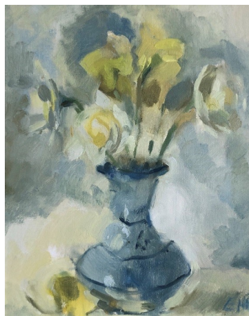
Daffodils in a Moroccan Vase, 2021

Oil on canvas board 20x30cm Frame with white gold leaf £650