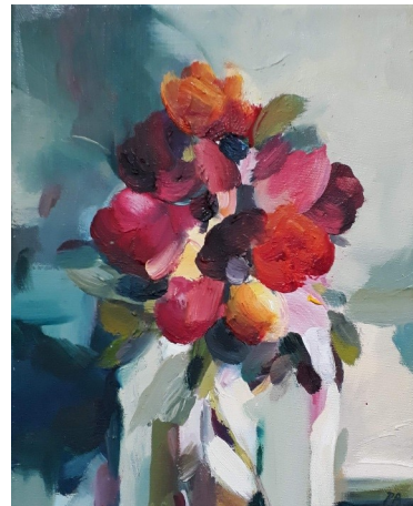
Saturday morning flowers