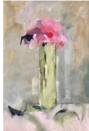
Pink Camelia, 2020

Oil on canvas board 24x30cm Frame with white gold leaf £675