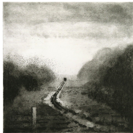
Dawn holding off the light