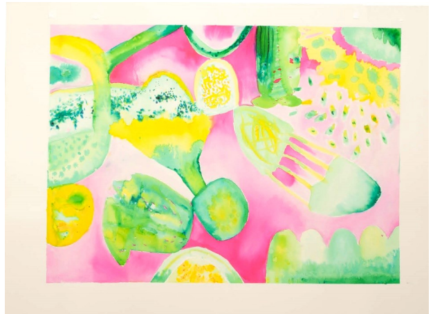
Through Smoke IV Watercolour and perfume on paper 76.5x56cm £450