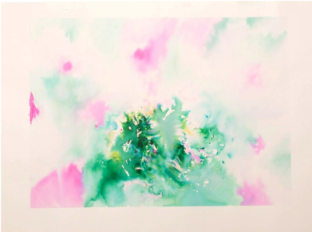
Through Smoke III Watercolour and perfume on paper 76.5x56cm £450