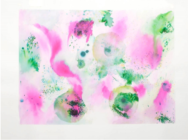
Through Smoke I Watercolour and perfume on paper 76.5x56cm £450