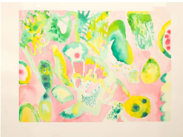
Through Smoke V Watercolour and perfume on paper 76.5x56cm £450