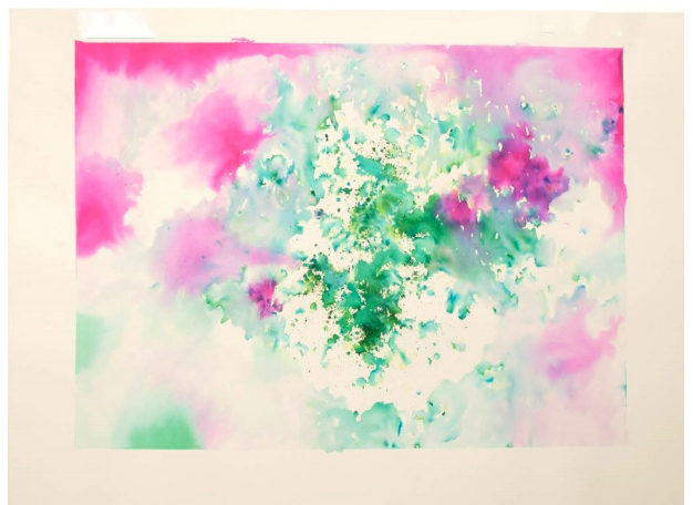
Through Smoke VI Watercolour and perfume on paper 76.5x56cm £450