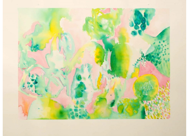
Through Smoke II Watercolour and perfume on paper 76.5x56cm £450